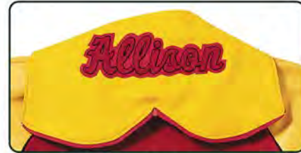
Scalloped Zipper Hood*

Available with or without Braid Choose from Criss Cross or Mitered Braid (shown) Available with or without zipper Zipper to match wool or white polar fleece