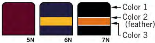
5N 6N 7N