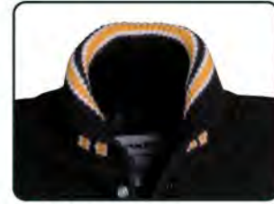
Roll Knit Collar*

Available in: • All Wool • Leather/Wool • Vinyl/Wool