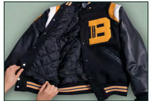
STEP 3 Apply decoration, turn jacket right side out and re-zip the lining.

*Jackets can be ordered without Full Access Zipper.