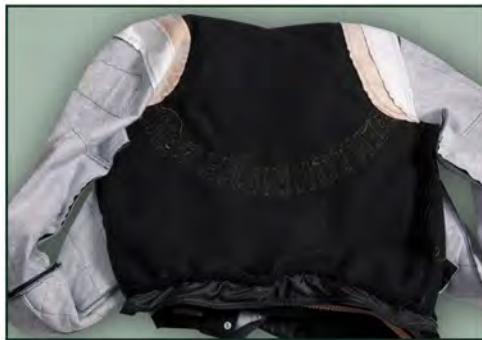
STEP 2 Reach under lining into sleeves and turn jacket inside out.