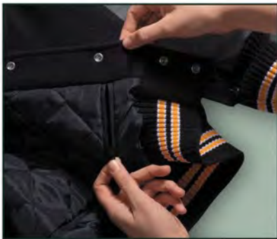
STEP 1 Unzip lining

FAZ System - Our Full Access Zipper (FAZ) gives decorators easy access for all post decorating requirements. The FAZ system is standard on all Leader Jackets (except LS322 and LS322W).