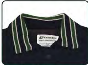
Hug Knit Collar*