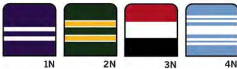
1N 2N 3N 4N